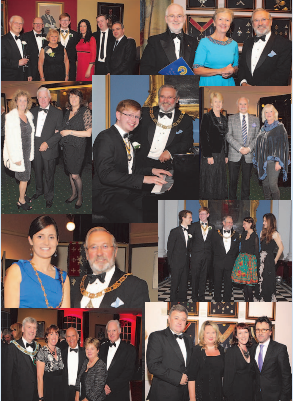
Pictured above are some of those enjoying the reception at the competition.